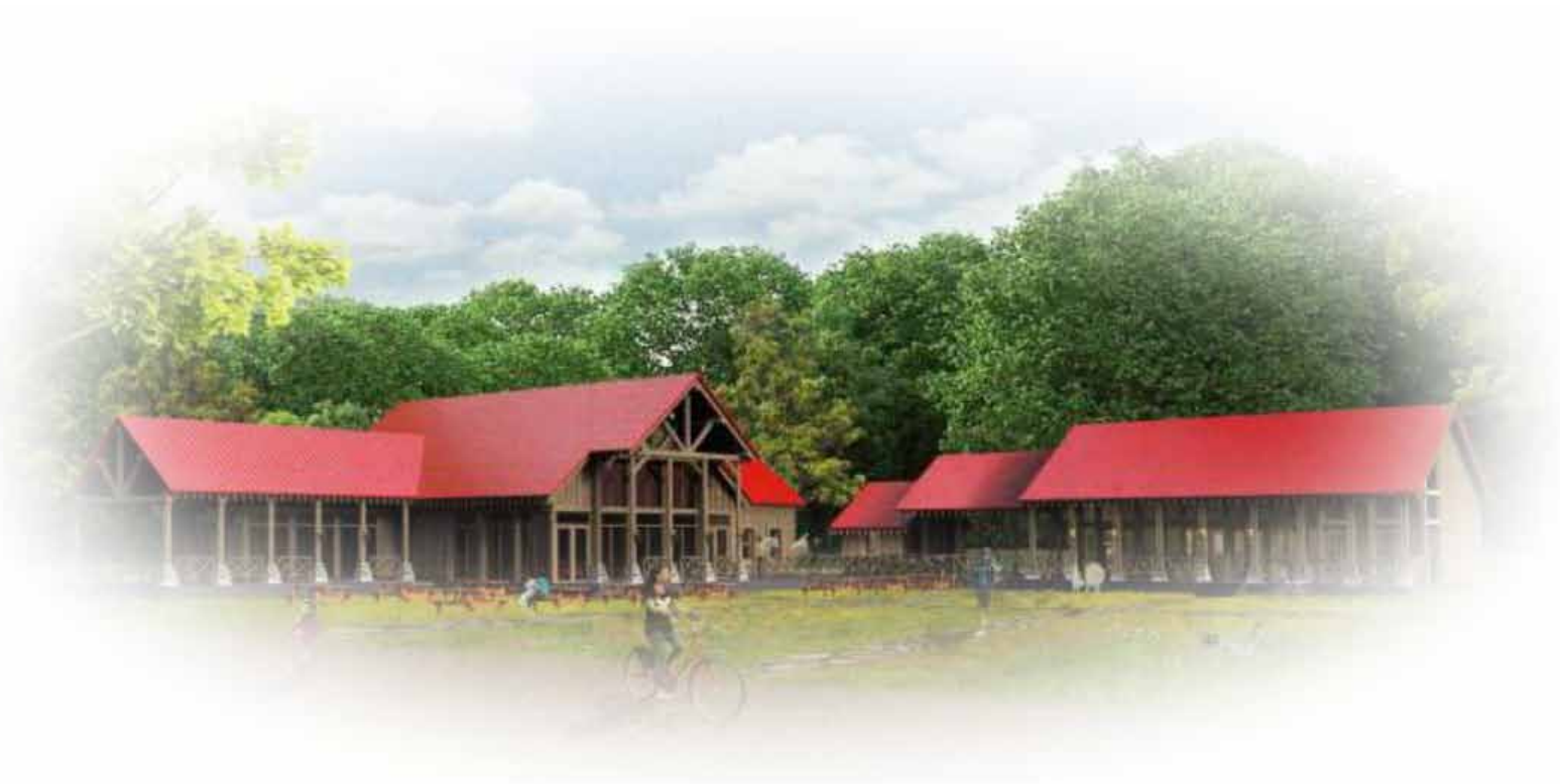
The new Creative Arts Centre and Fitness Centre. This is a rendering only; subject to change.